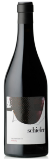
Cult-wine status for Ried Reihbur Blaufränkisch from Uwe Schiefer